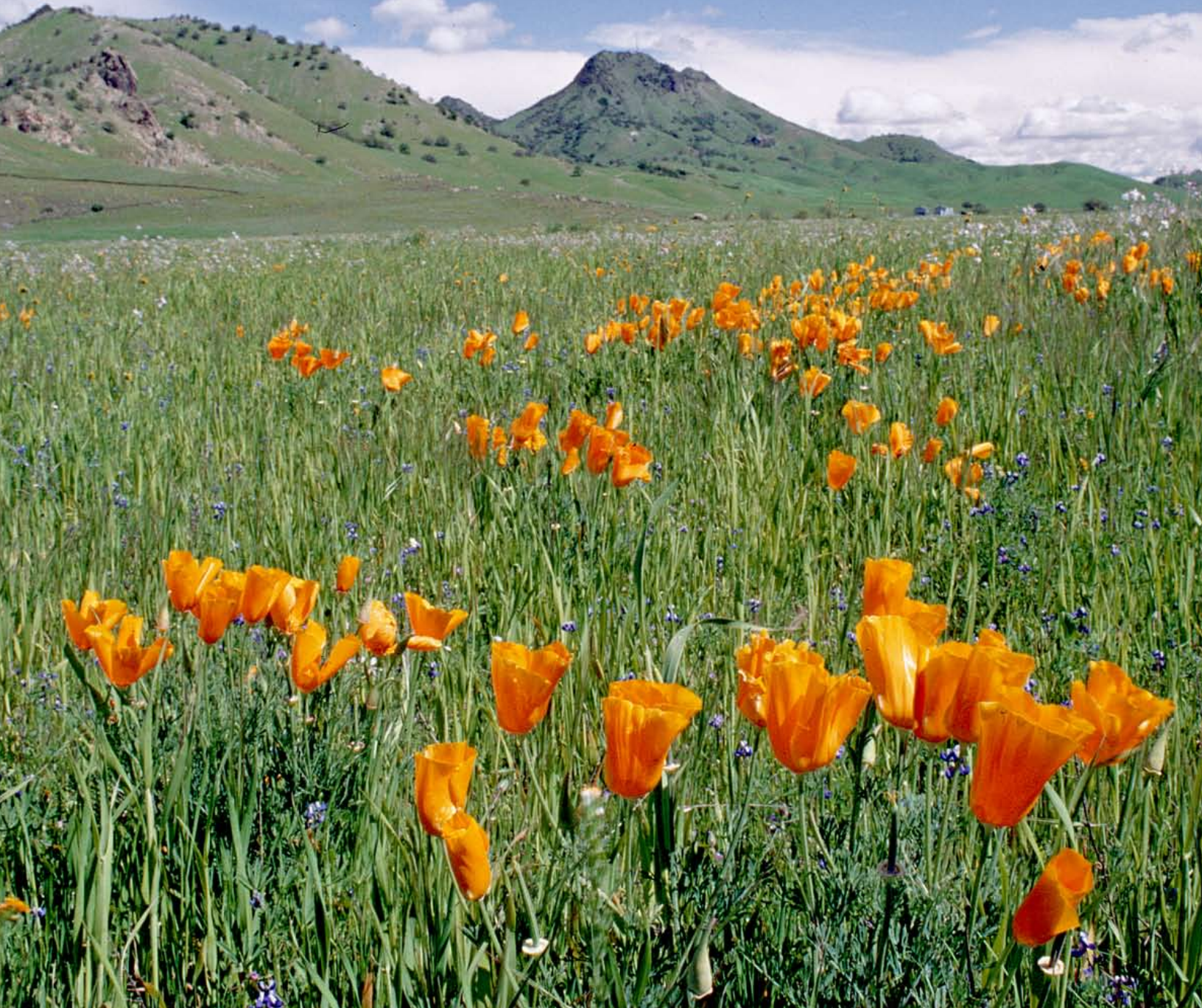
Poppy field off Pass Road