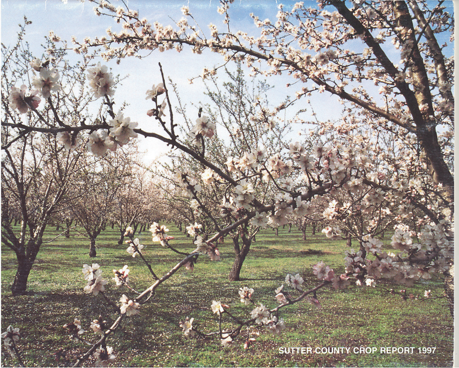
SUTTER COUNTY CROP REPORT 1997