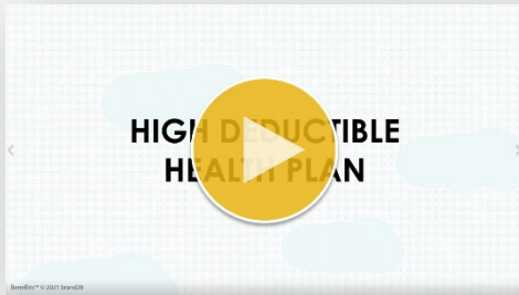
High Deductible Health Plan

Click below for additional online resources.