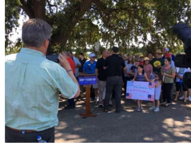
Dozens gathered on the Yuba City levee demanding a swift levee fix at Yuba City below Oroville Dam in the months after the dam was damaged.

It depends on what the situation is. There are maps for different incidents like a partial or total dam failure. It's hard because of topography and we don't know where a breach would occur. Without that, it is really impossible to provide an inundation map. Maps are only as good as a series of assumptions and every storm is different and has to be created within that moment and forecast. The best thing to do is if we're advising of a voluntary or mandatory evacuation, please heed the warning.