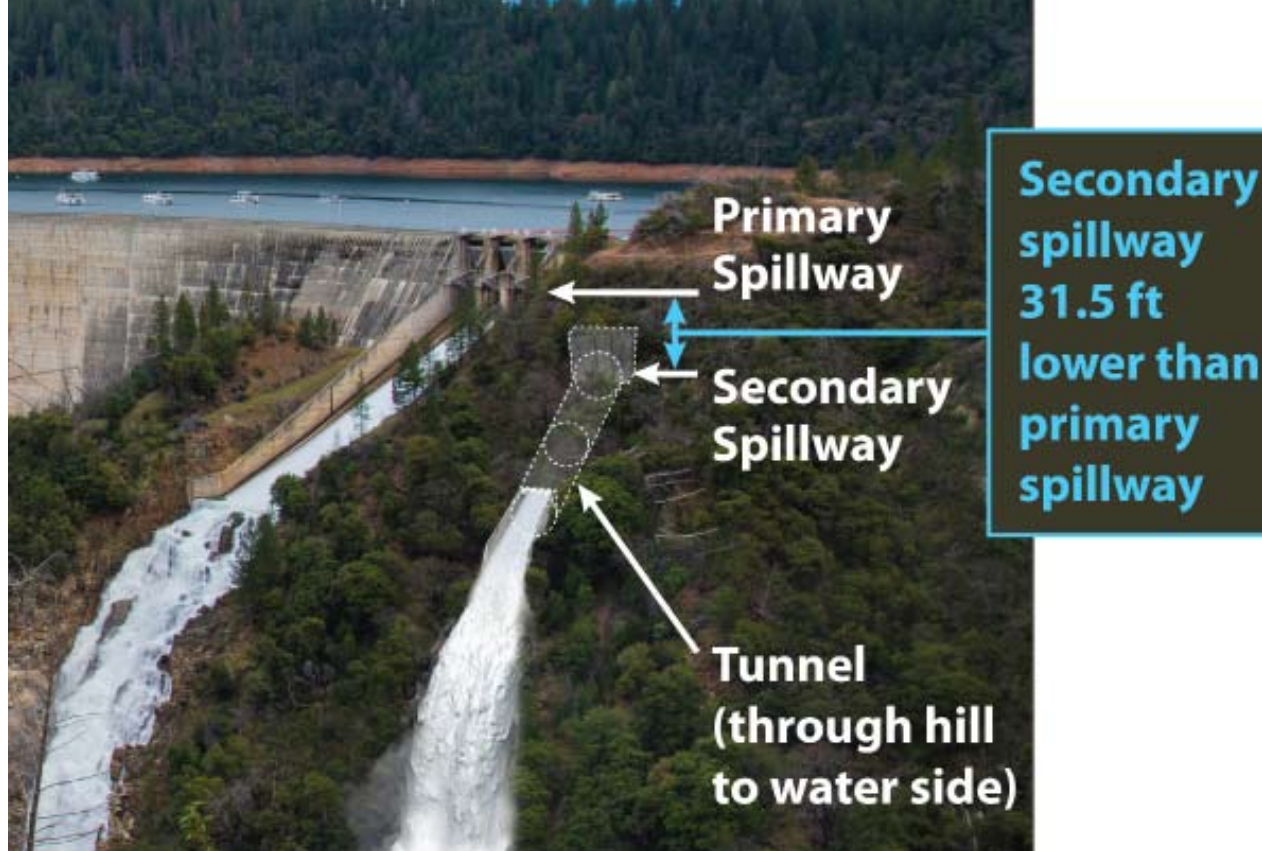
A second spillway at New Bullards Bar Reservoir is expected to be completed in 2025.

45,000 cubic feet per second in advance of and during storm events, creating additional space in the reservoir to contain storm water runoff and snowmelt from the watershed.