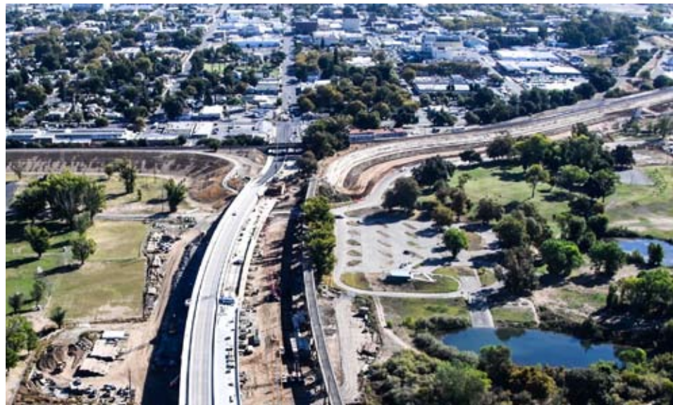
(Left) The U.S. Army Corps of Engineers is completing a half-mile long slurry cutoff wall on the Marysville ring levee, south of the Fifth Street Bridge. (Below) Previously, work was completed on the eastern end of the ring levee system at East Marysville (Nadene and Johnson avenues pictured).

will see work shift to the eastern border of Marysville, constructing similar levee improvements from Jack Slough Road down to Highway 70. This work is expected to take four construction seasons to complete. (A construction season is from April 15 - October 31.)