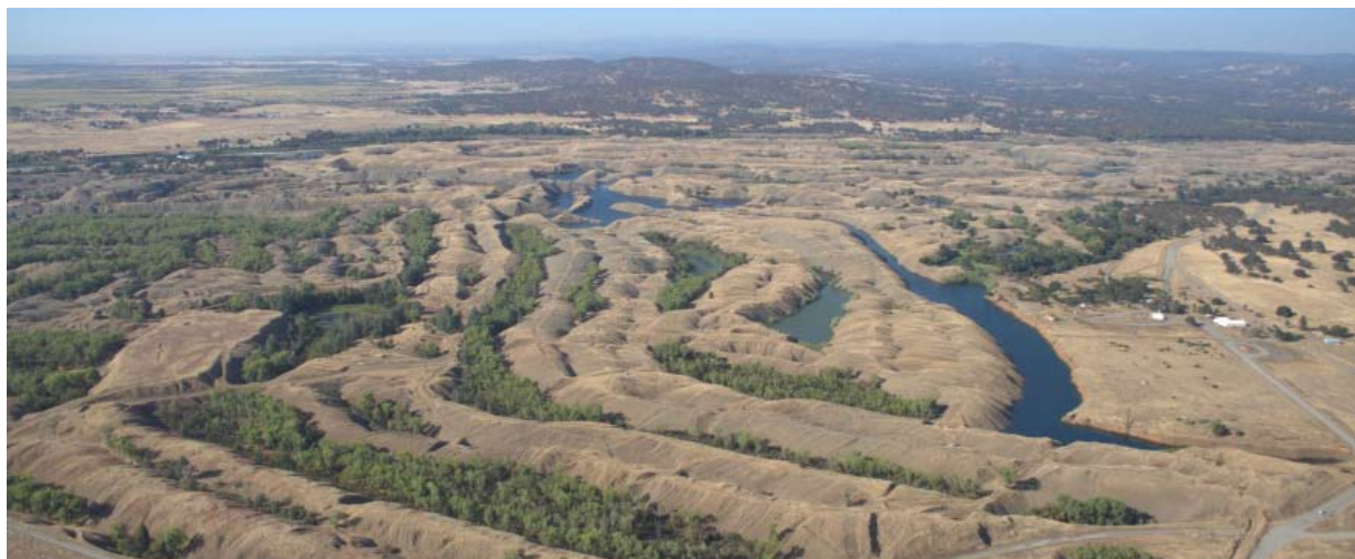
Next year, TRLIA will break ground on a levee tying into the Yuba Goldfields, the last project to reach 200-year flood level protection

TRLIA, a joint powers authority of Yuba County and Reclamation District 784, was formed in 2004 to finance and construct levee improvements to meaningfully reduce flood risk and ward off FEMA-imposed regulations for properties in high-risk flood zones. These include mandatory, higher-cost flood insurance and building restrictions that can result in complete moratoriums on new and replacement construction. TRLIA embarked on a four-phase program resulting in approximately $500 million in levee improvements, the bulk of which are being paid for by the state. The local share is largely being